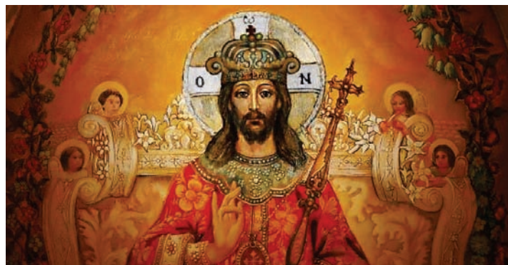
SOLEMNITY OF OUR LORD JESUS CHRIST, KING OF THE UNIVERSE

Sunday is the Solemnity of Christ the King and the last week of the liturgical year. The readings remind us of God's faithfulness to us as he promises to shepherd the people of Israel. In Luke's Gospel we are taken to the crucifixion and Jesus being mocked as "King of the Jews." The man crucified next to him asks Jesus to remember him when he gets into his Kingdom. Jesus replies, "Amen, I say to you, today you will be with me in Paradise."